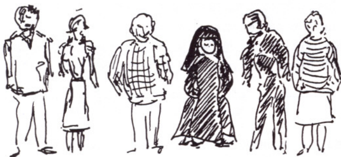
GOOD BITS AND BAD BITS

Good bits and bad bits God loves my good bits. God loves my bad bits.